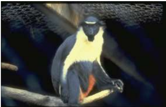
diana monkey ( Cercopithecus diana )