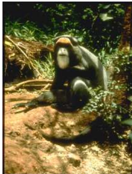
de Brazza monkey ( Cercopithecus neglectus )