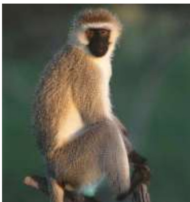
patas monkey ( Erythrocebus patas )